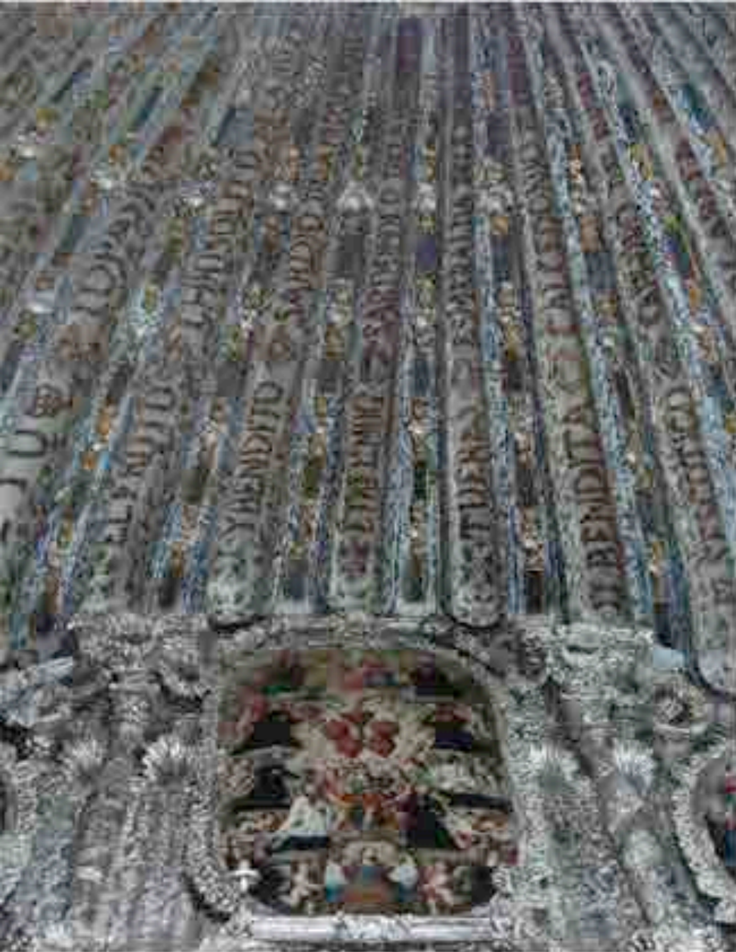
ATOTONILCO. CHAPEL OF THE VIRGIN OF THE ROSARY. CAMARIN