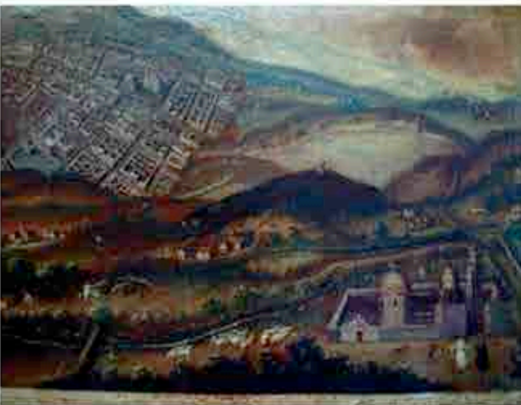
MIGUEL ANTONIO MARTÍNEZ DE POCAHANGRE. SAN MIGUEL EL GRANDE AND THE SANCTUARY OF ATOTONILCO