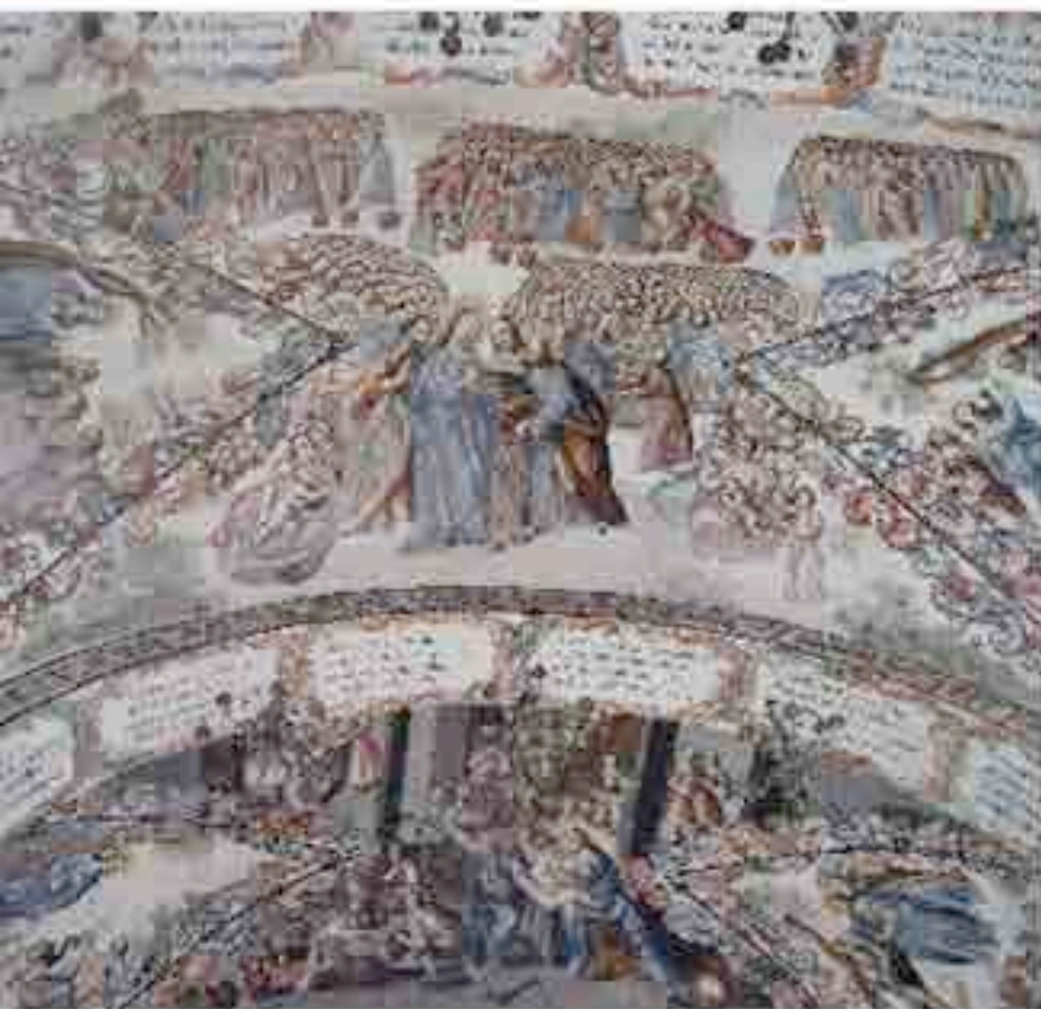
MIGUEL ANTONIO MARTÍNEZ DE POCASANGRE. THE MIRACLE OF THE MULTIPLICATION OF THE BREAD AND THE FISH . CHAPEL OF CALVARY, DOME.