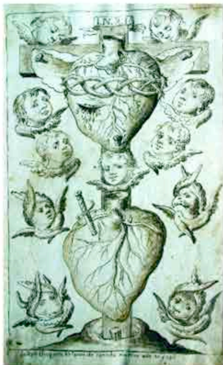
BOOK OF SANTA ESCUELA DE CRISTO