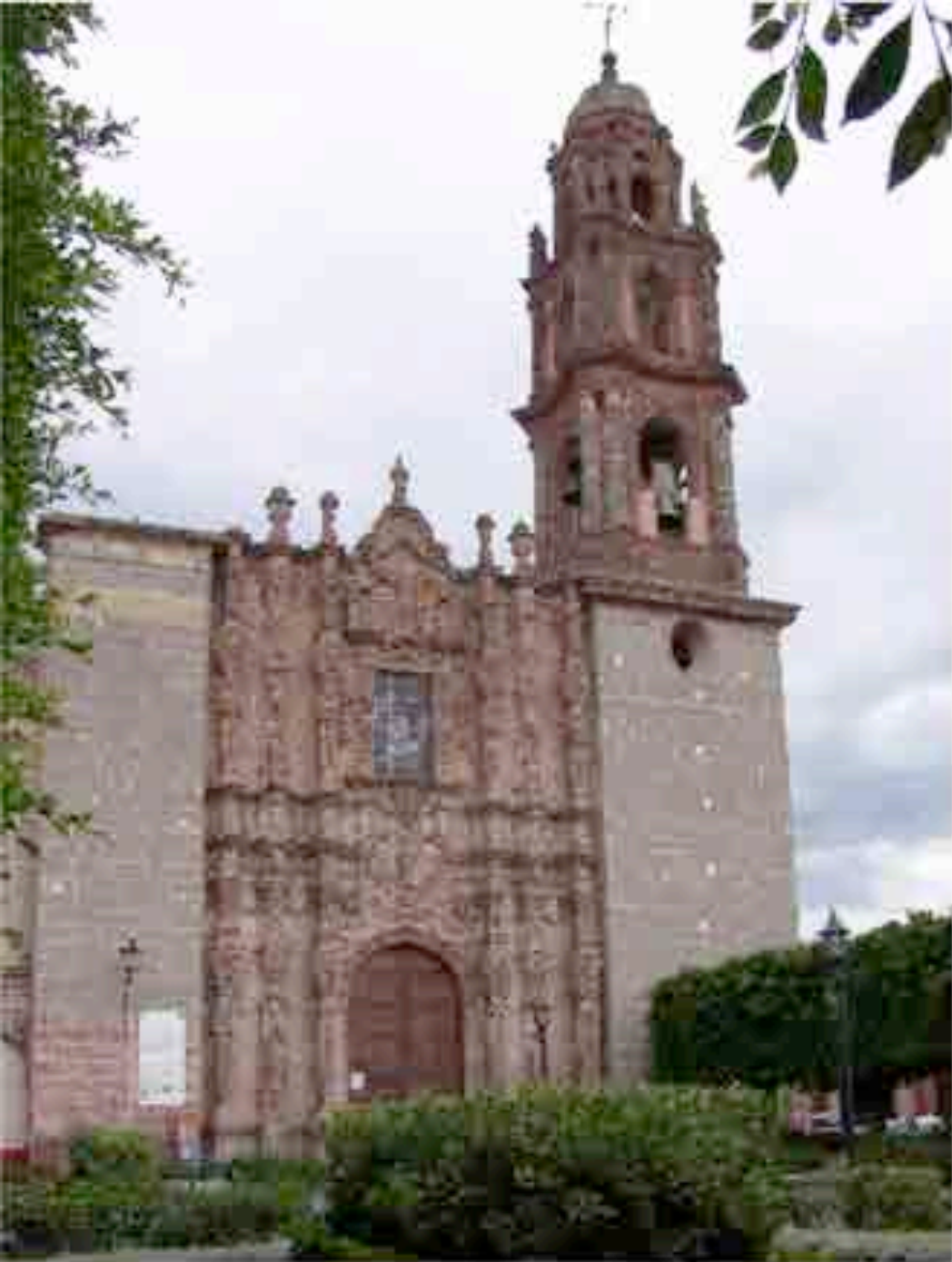
TEMPLE OF SAN FRANCISCO DE ASÍS