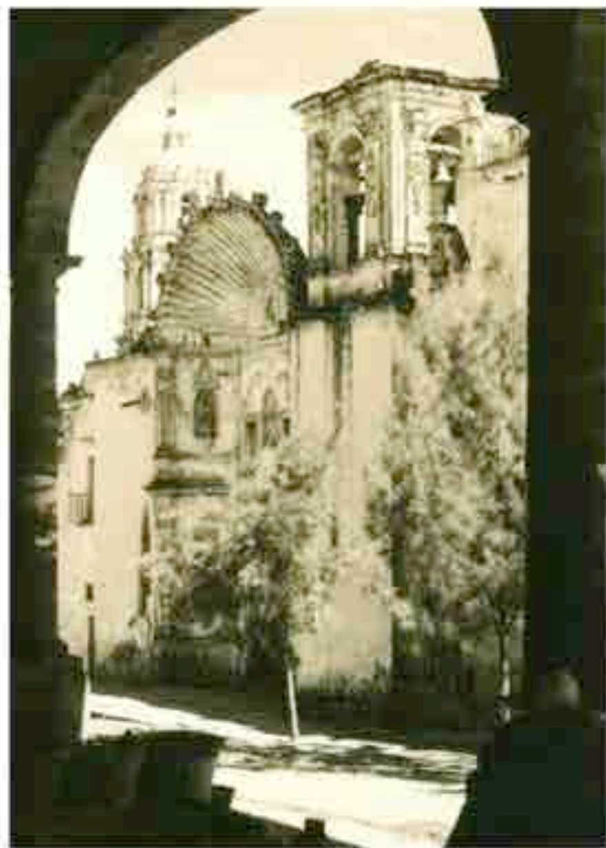
CHURCH OF LA SALUD, c. 1928