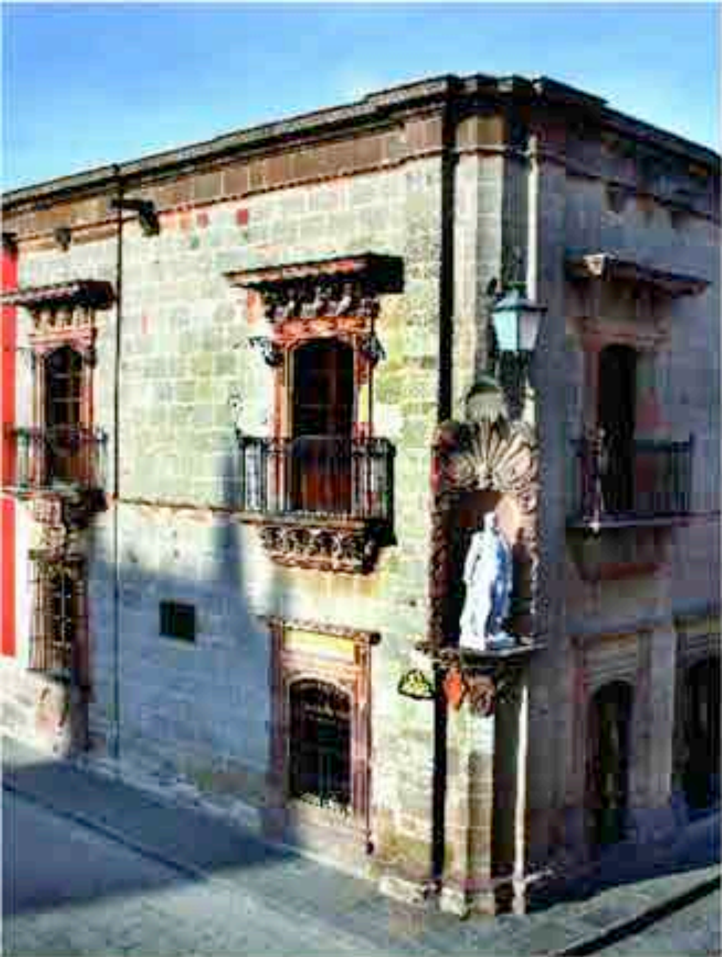
HOME OF DON DOMINGO DE ALLENDE