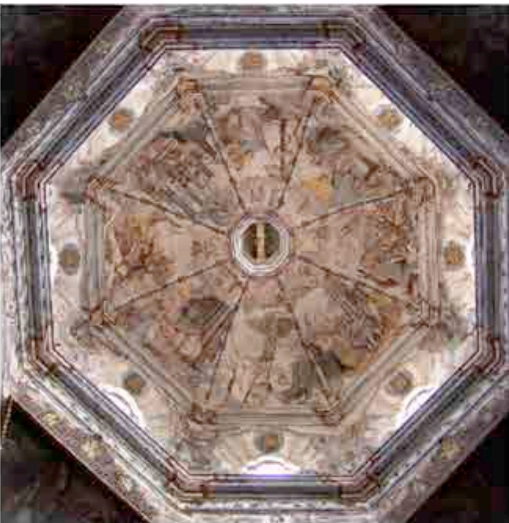
ATOTONILCO, CHAPEL OF CALVARY, DOME