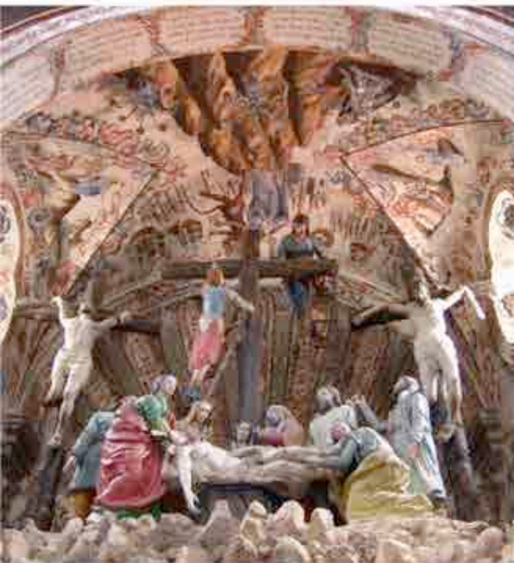
ATOTONILCO: CHAPEL OF CALVARY. THE DESCENT