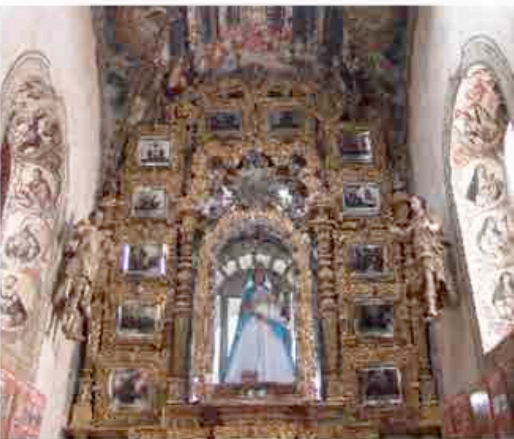
ATOTONILCO. CHAPEL OF THE VIRGIN OF THE ROSARY. ALTARPIECE