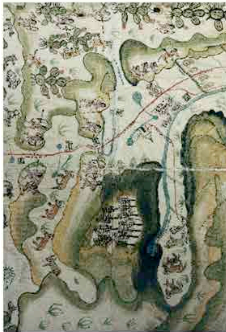
MAP OF THE TOWN OF SAN MIGUEL AND ITS JURISDICTION (1580) ARCHIVES OF THE ROYAL ACADEMY OF HISTORY, MADRID