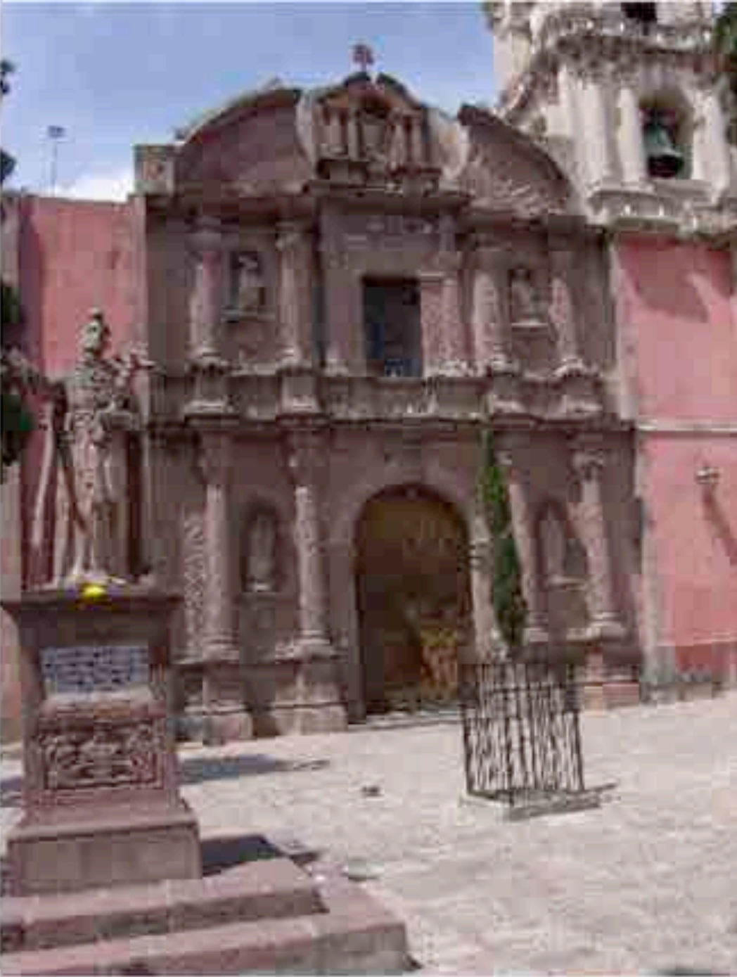
ORATORY OF SAN FELIPE NERI