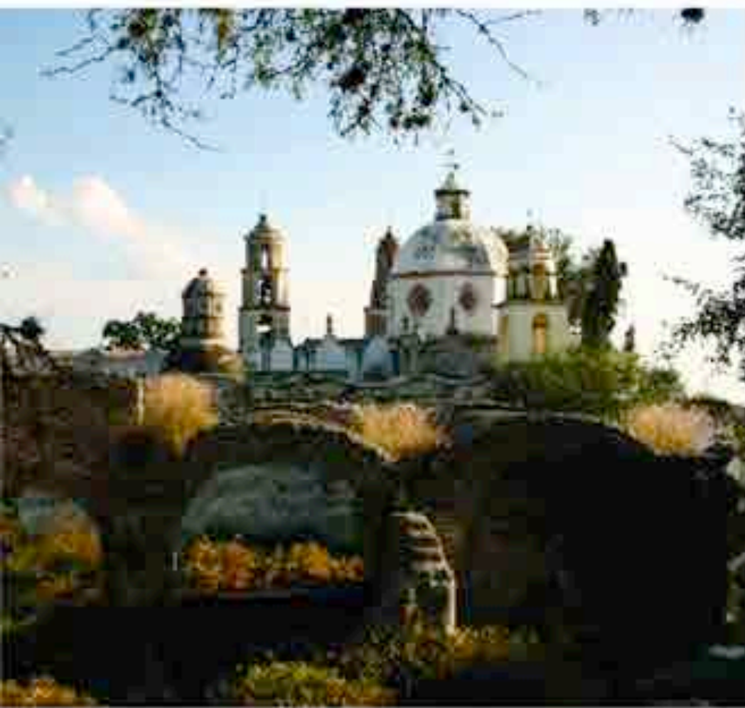
VIEW OF ATOTONILCO